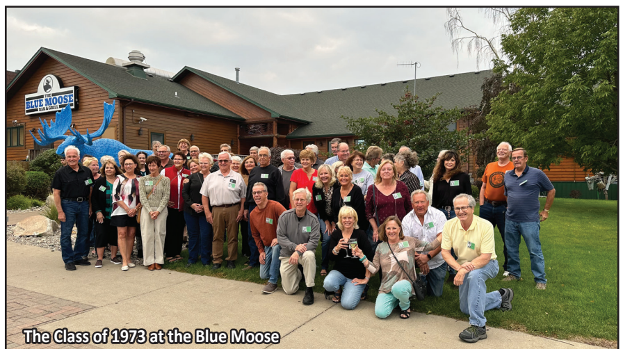
The Class of 1973 at the Blue Moose