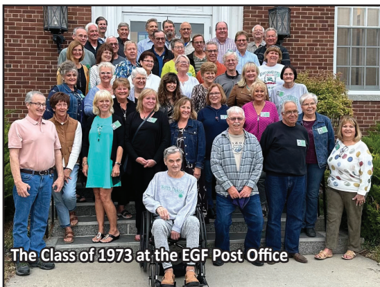
The Class of 1973 at the EGF Post Office